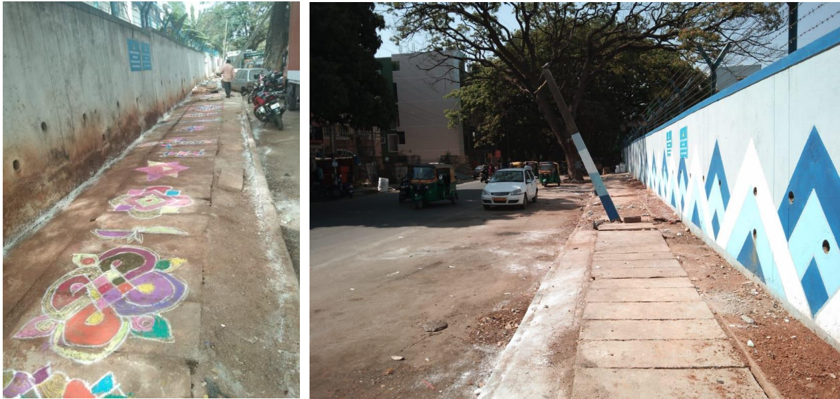
Picture 24 and 25: Footpaths in Wind Tunnel Road near the Kasa Kiosk