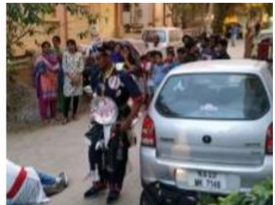
Picture 5, 6, 7, 8, and 9: Survey, awareness campaign and street play images