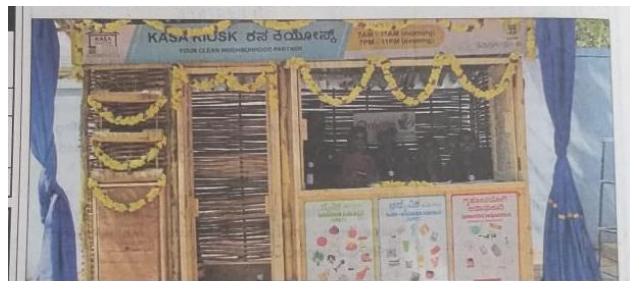
The Kasa Kiosk set up near Air Force campus on NAL Wind Tunnel Road, Murugeshpalya.

While the kiosk is a solution to manage waste better, it is the responsibility of every individual to support and consciously make eco-friendly choices to bring changes in Bengaluru and other cities too.