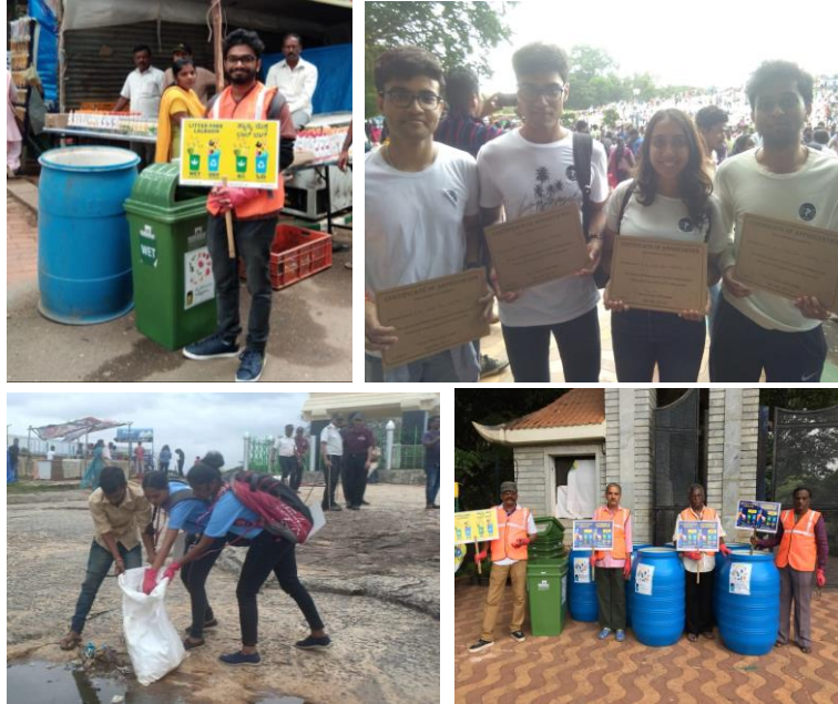
We engaged about 180 volunteers in the span of 10 days

We had identified most visited zones of Lalbagh and there were 5 such zones. Throughout the day we had 6 staff members from Saahas and 18-20 volunteers to monitor the bins in these zones to ensure segregation of waste at source and zero littering.