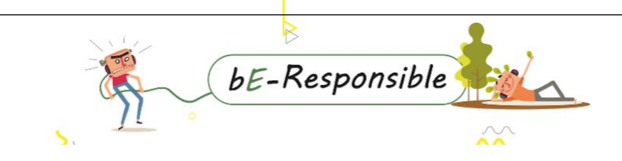
E-waste management program in Mahadevapura Zone