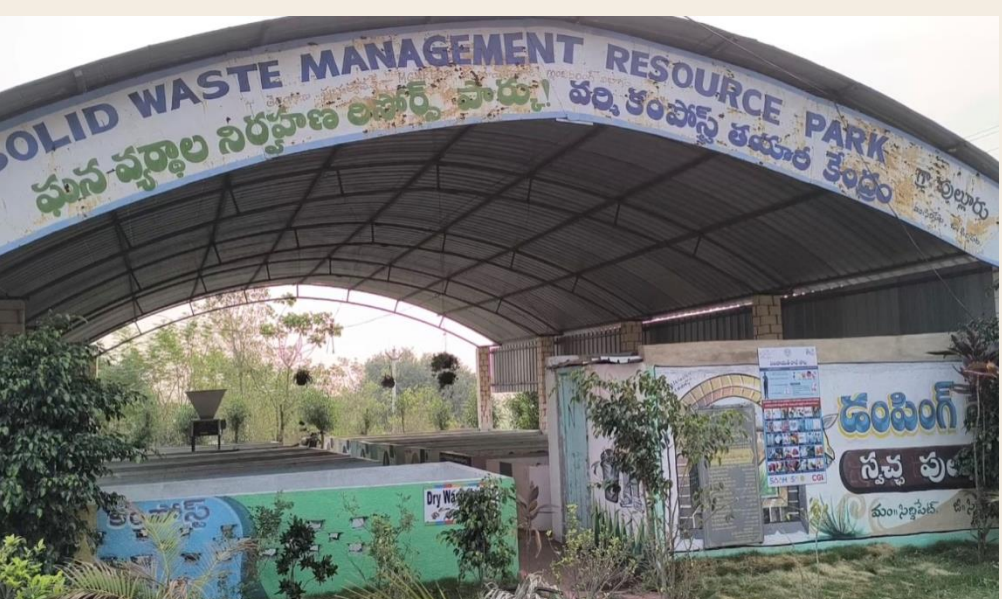
Figure 4: Resource recovery centre at Pullur.

Biodegradable waste rotting in the dumpsites is a major source of methane gas, a strong greenhouse gas, contributing significantly to global warming. Wet or biodegradable waste is converted into compost which can be used by the village farmers. Processing of dry or non-biodegradable involves sorting it into different categories, paper, plastic metal etc. which are then sent for recycling. Some waste is also sent to the Dry Waste Collection Centre of Siddipet where further sorting takes place.